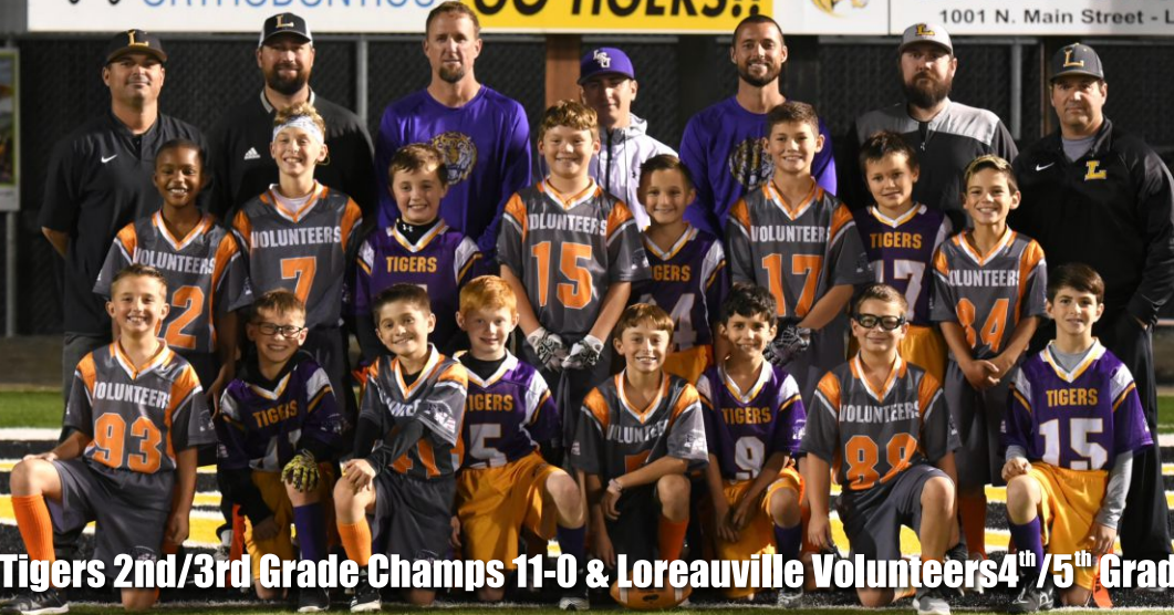
Loreauville Tigers 2nd/3rd Grade Champs 11-0 & Loreauville Volunteers 4 th /5 th Grade Champs 11-0